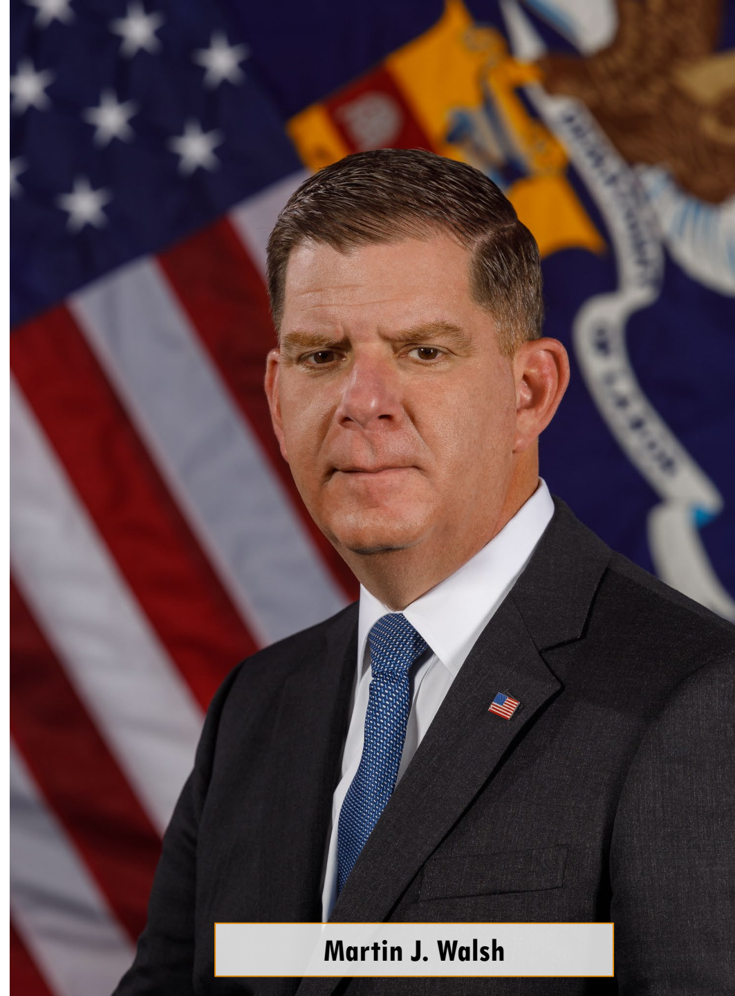
Martin J. Walsh

Born and raised in the neighborhood of Dorchester by immigrant parents, Secretary Walsh is driven to ensure our nation's economy works for everyone. Secretary Walsh is a survivor of Burkitt lymphoma and is a proud member of the recovery community who has worked to expand addiction treatment throughout his career. While working full-time as a legislator, he returned to school to earn a degree in Political Science at Boston College.